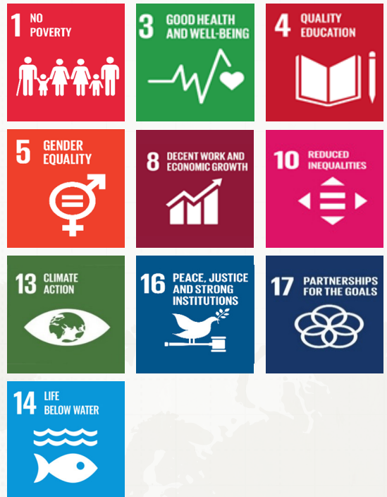
Figure 1: Sustainable Development Goals

local and continental levels. The exhibition also encourages young entrepreneurs, including youth and women, to showcase their local initiatives in pursuit of Agenda 2063 and pertinent sustainable development goals (SDGs).