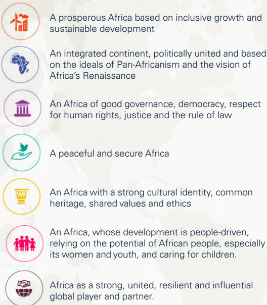
Figure 2: Agenda 2063 Moonshots

The Government of Sierra Leone, African Union Commission (AUC), African Union Development Agency (AUDA-NEPAD), United Nations Office for South-South Cooperation (UNOSSC), Islamic Development Bank (IsDB), UNDP- Addis Ababa centre, Saudi Fund for Development (SFD), Tunisian Agency for Technical Cooperation (ATCT), World Food Program (WFP), Japan International Cooperation Agency (JICA), European Union (EU), Rwanda Cooperation Initiative (RCI), Organisation for Economic Co-operation and Development (OECD). All partners and countries from the Global South, African development agencies, civil society organisations, research institutes and think tanks, as well as African youth and women are highly encouraged to participate in the exhibition.